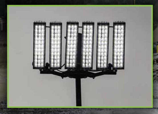
Directional area flood lighting