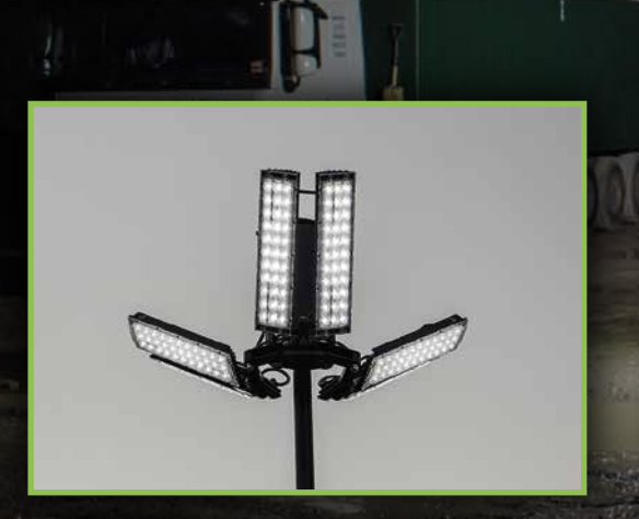
360° area flood lighting

The K45 is the easiest and safest product to operate in its class