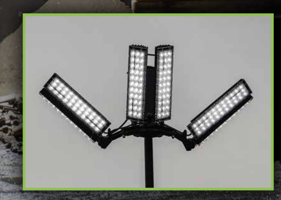
Adjustable light anywhere between 180° and 360°